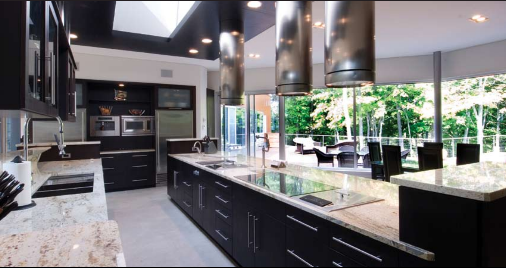
Another hillcraft kitchen – Photos courtesy of Somrak Kitchens, Bedford Heights, OH.

TRANSFORMATION 2008 AIA Wisconsin Convention & Expo April 30 - May 1, 2008 Monona Terrace, Madison, WI