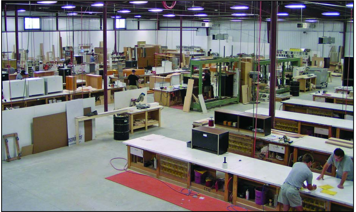
Hillcraft's expansion has allowed the introduction of additional equipment and more workspace for custom projects.

Hillcraft has satisfied the requirements and is now a certified member of Architectural Woodwork Institute's (AWI) Quality Certification Program. In order to achieve this certification, we had to pass four areas: First, our project managers had to pass a 150 question test, which they scored very high on. Second, we needed ten trade references including architects, contractors and building owners. Third, we had to pass a plant inspection examining everything from material handling and safety to workmanship. Finally, we had to pass two job site inspections by the AWI representative. The certification puts Hillcraft in an elite group of millwork manufacturers to achieve this status. AWI QCP certification is required on certain high end projects such as the new University of Wisconsin Microbial Science building Hillcraft will be doing in the next few months.