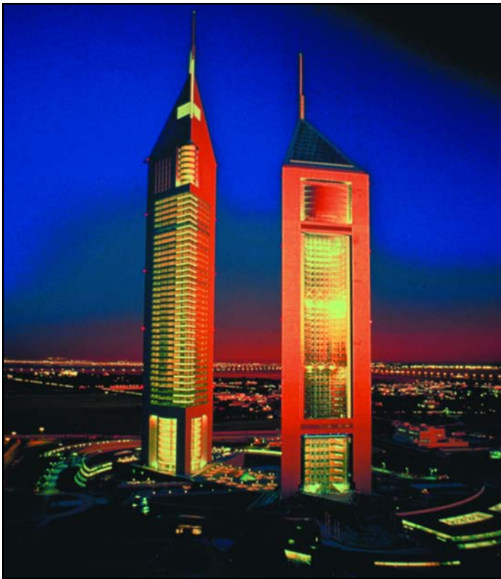
Emirates Tower Hotel – Dubai